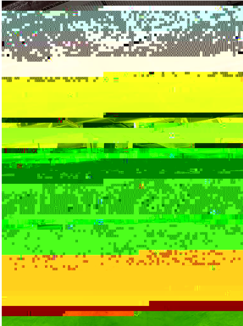
New steel installation in future Large Dance Rehearsal