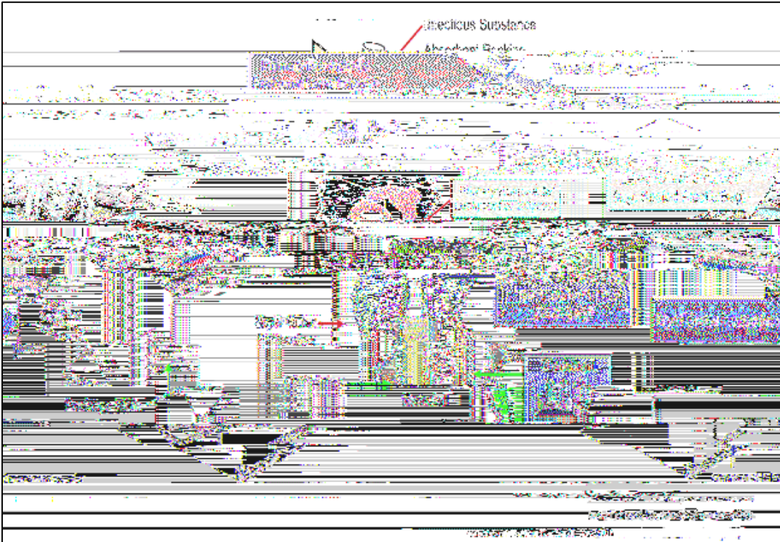
Figure 2: Marking/Labeling for Cat. B on Dry Ice